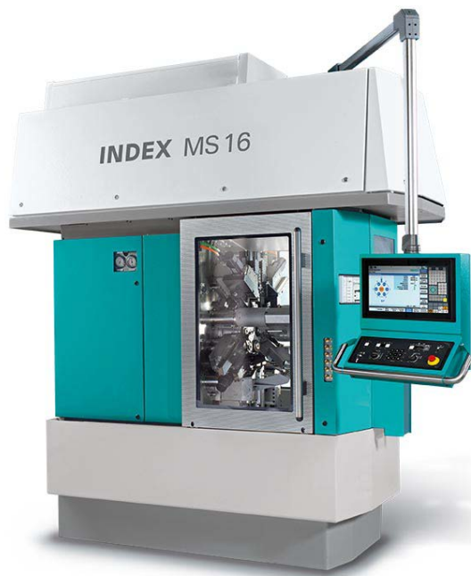
Figure 1: The INDEX MS16 Plus