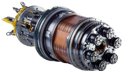
Figure 3: Spindle drum of the INDEX MS16 Plus with 6 fluid-cooled motorized spindles with synchronous technology